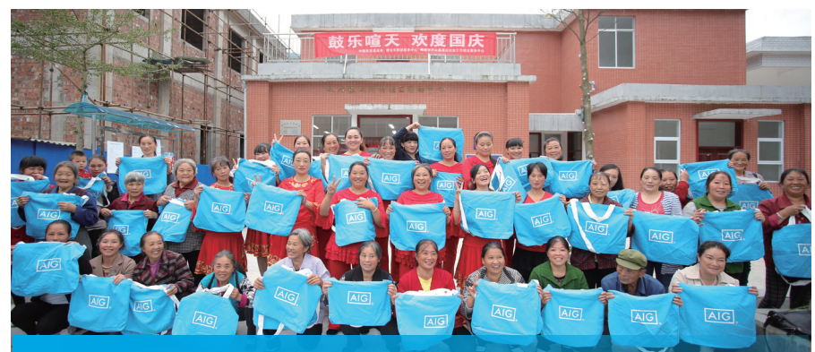
AIG supports community center in Shuanghe, Lushan, Sichuan Province (2016)